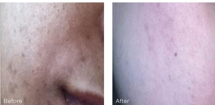
ACNE | HYPERPIGMENTATION

Results after a combination of 2 Venus Viva treatments while using Stem Cell Therapy Serum & Accelerator 2x daily, over 8 weeks